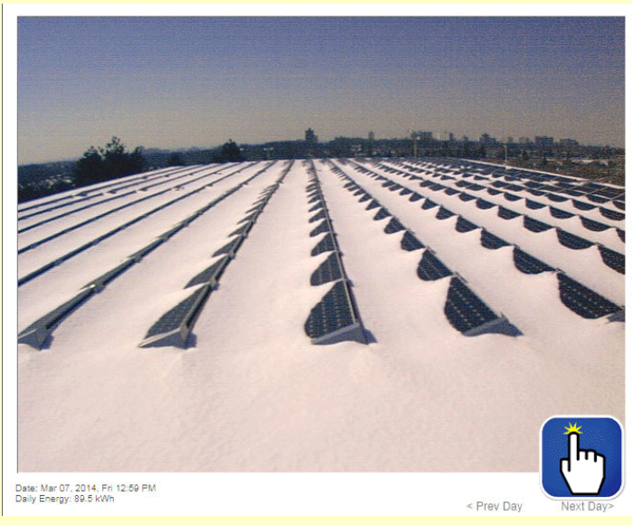
Check actual roof conditions with SnoCam

SnoCam takes a <u>photo each day</u> at noon so you can check monthly output against local weather conditions.